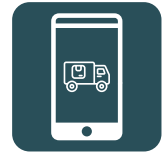
Delivery Agent App