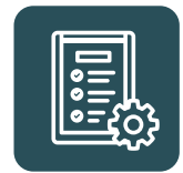
Reconciliation & Reporting