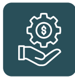
Payment Collection & Tracking