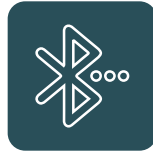
Bluetooth Printer Support