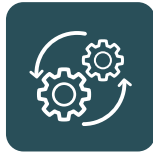
Integrated Delivery Dashboard