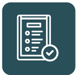
Real-Time Order & Stock Management