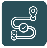
Smart Route Planning