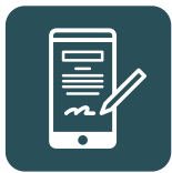
eSignature POD Capture