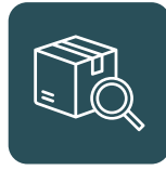
Live Delivery Tracking