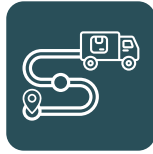
Customer & Route Management